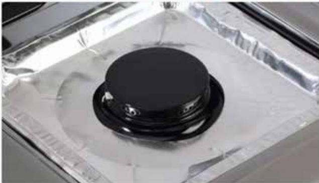
Aluminum stovetop burner covers

Keeping your stovetop burners free of stains and food particles is one of the most Sisyphean tasks in the kitchen, so I was kind of blown away when I saw these disposable aluminum burner "bibs" in my friend's kitchen recently.