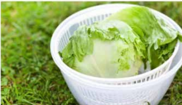
Salad Spinner

I hesitated to include a basic salad spinner on this list because I assumed pretty much everyone had one. It wasn't until I polled my friends and co-workers and discovered that, somewhat insanely, most of them did not own a salad spinner.