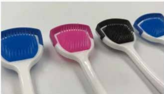
Tongue Cleaner

Speaking of things that most people don't realize are disgusting—let's talk about your tongue. I wrote about the magic of tongue-cleaners in my list of 5 life-changing products for under $10 , but here's the bottom line: Your tongue is a lot grosser than you think it is, and having a gross tongue is great way to develop bad breath. Yuck.