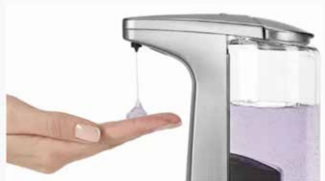
Automatic Soap Dispenser

When I first got this soap dispenser as a gift, I was like, "A soap dispenser! Neat!" I wasn't disappointed or anything. I just wasn't really ready to fall in love with a thing that dispenses soap. But this has been living in my kitchen for over a year and I cannot imagine a time before it lived there. Cleaning slimy chicken hands is no longer an ordeal, and cleanliness in the kitchen is imperative.