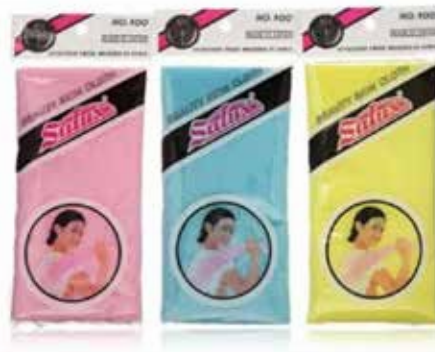
Salux Bath Scrubber

You know that poofy mesh ball you use in the shower to clean your body? It's absolutely disgusting. It's basically a ball of dead skin and bacteria that spends all of its time hanging out in the warmest, wettest place in your home, making it a breeding ground for all sorts of nasty stuff. Don't believe me? Ask a dermatologist.