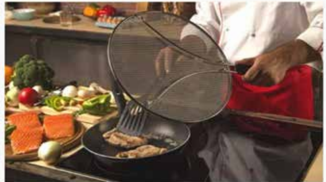
Grease Splatter Guard

If you're sensing a "dirty kitchen" theme, it's only because I've struggled to keep my kitchen clean for years, constantly searching for ways to keep the room free from basic cooking nuisances: