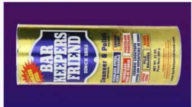
Bar Keeper's Friend

This stuff's a miracle. Got some old cookware covered in gunk? Dust some Bar Keeper's Friend and on there and bring your pans back to life. Countertops looking a little punished? Bar Keeper's Friend's got your back. It specializes in stainless steel and has its PhD in filthy bathtubs.