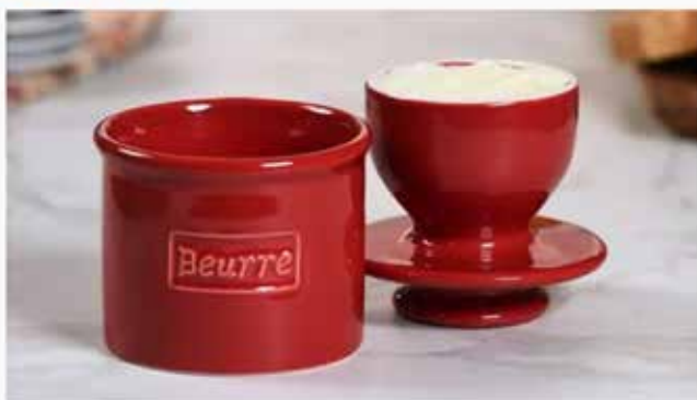
Butter Bell

You've probably heard of these things, but you also probably don't have one. And frankly, that's upsetting, because everyone should experience the joy of having spreadable, room-temperature butter at the ready at all times.