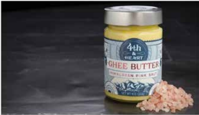
Ghee Butter

Where do I even start? Ghee has transformed my understanding of delicious butters. It's a form of clarified butter, so it's lactose free, making it perfect for people with lactose sensitivity. Since the smoke point of ghee tends to be much higher than regular butter, you can use it when searing meat at super-high temperatures without the taste getting bitter.