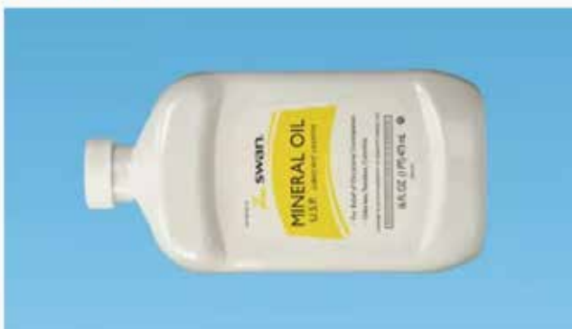
Mineral Oil

Another thing I love about Epicurean cutting boards (sorry) is that they can take a relatively long beating before you need to treat them with something like mineral oil. In the meantime, I use mineral oil to store my razor blades, which unmistakably extends the life of your razors. Seriously—it's the best kept secret in shaving.