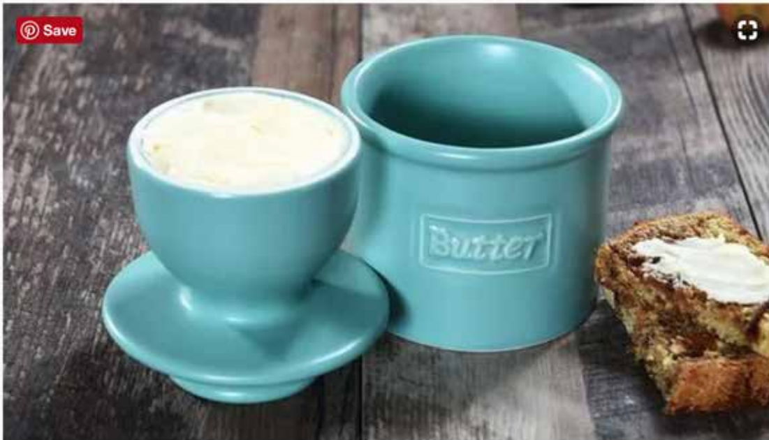
15 products under $40 that totally changed my life