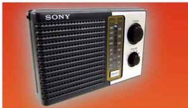
Transistor Radio

Not much to say about this one. I bought mine so I could listen to Red Sox games on my porch with a beer in my hand (the way baseball was meant to be listened to), but then I started moving up and down the AM dial, discovering all sorts of interesting programming. Turns out the terrestrial airwaves are alive and well! My pick is this quintessential-looking Sony—it's got a huge antenna, sounds great, and the volume is much louder than you'd think.