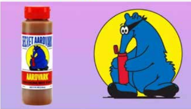
Secret Aardvark Sauce

I bet you weren't expecting to see the words "Secret Aardvark Sauce" on this list, huh? If you're big into hot sauces (particularly versatile, entry-level hot sauces like Sriracha) you owe it to yourself to try this stuff. This Tex-Mex-meets-Caribbean hybrid is incredibly popular in Oregon, and it's easy to see why: It's a tangy, sweet, and addictive as hell.