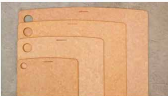
Epicurean Cutting Board

I bought an Epicurean cutting board and loved it so much I wrote an embarrassing love letter to it shortly thereafter. You can go read the salacious details yourself, but here's what you need to know: They're durable, versatile, dishwasher safe, and won't ruin your knives. They look great in any kitchen, too. OK—I'll shut up about the Epicurean cutting board now. I promise.