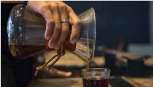
Chemex Coffee Maker

My favorite way to brew coffee is with a Chemex. It's somewhat of a meditative process: arrange the filter, get the water to the appropriate temperature, and monitor the water level as you pour over the grounds. Admittedly, it's not for everyone, which is why I recommend starting with this $37, 3-cup, entry-level model.